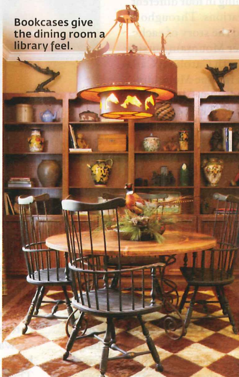
Bookcases give the dining room a library feel.