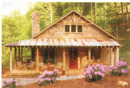
A rhododendron railing and recycled-metal roofing lend rustic character.

Whisper Mountain outside Asheville, North Carolina