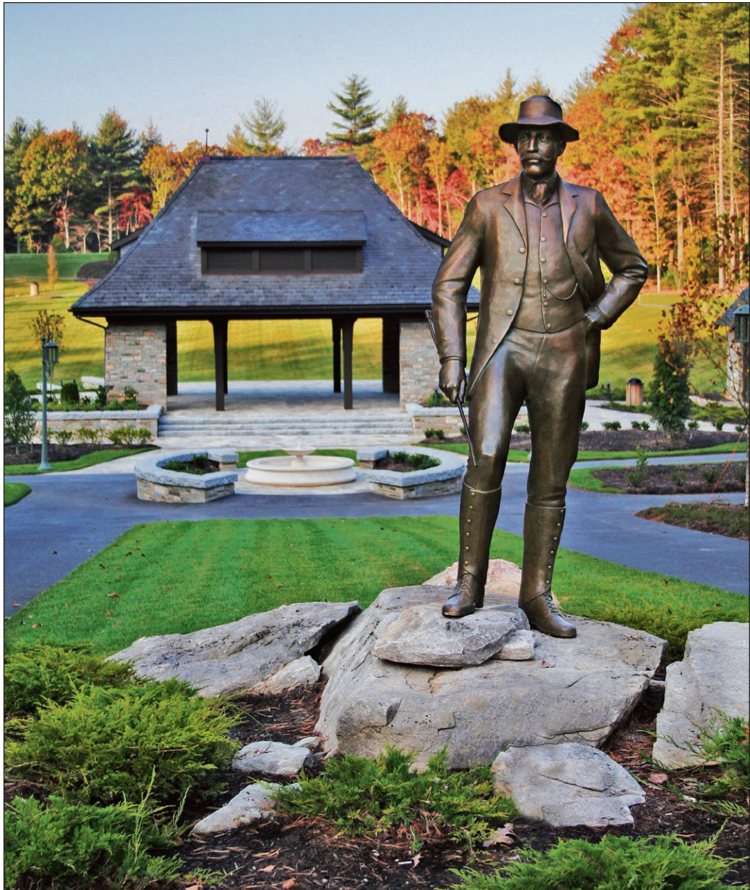
The Ramble's Longmeadow Park.

In fact, the sense of community is strengthened and maintained by Biltmore Farms commitment to stewardship. Both of the Biltmore Farms communities, The Ramble and Biltmore Lake, have special charitable funds administered by The Community Foundation of Western North Carolina. Through a grant process administered by the Community Foundation, the charitable funds for Biltmore Farms Communities have made over $230,000 in grant funds available to support