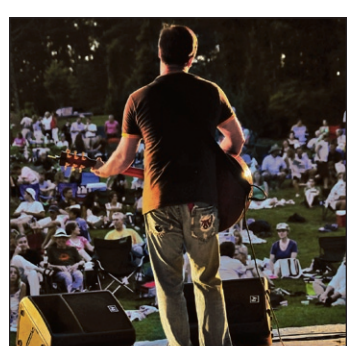
Edwin McCain plays to a lively crowd during The Ramble Summer Concert in June of this year.